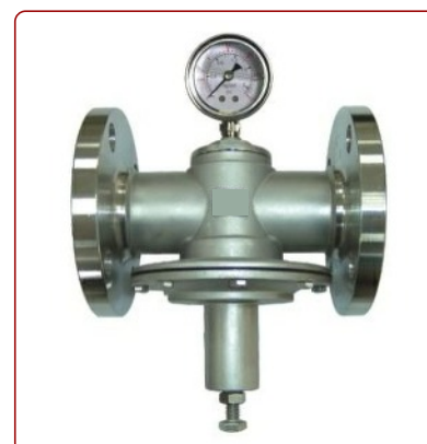
(Flanged model shown)